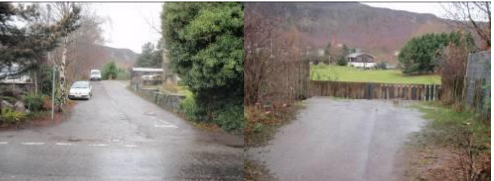
Figures 2 & 3. - View towards site from Grampian Road and view of fence to the resort lands.